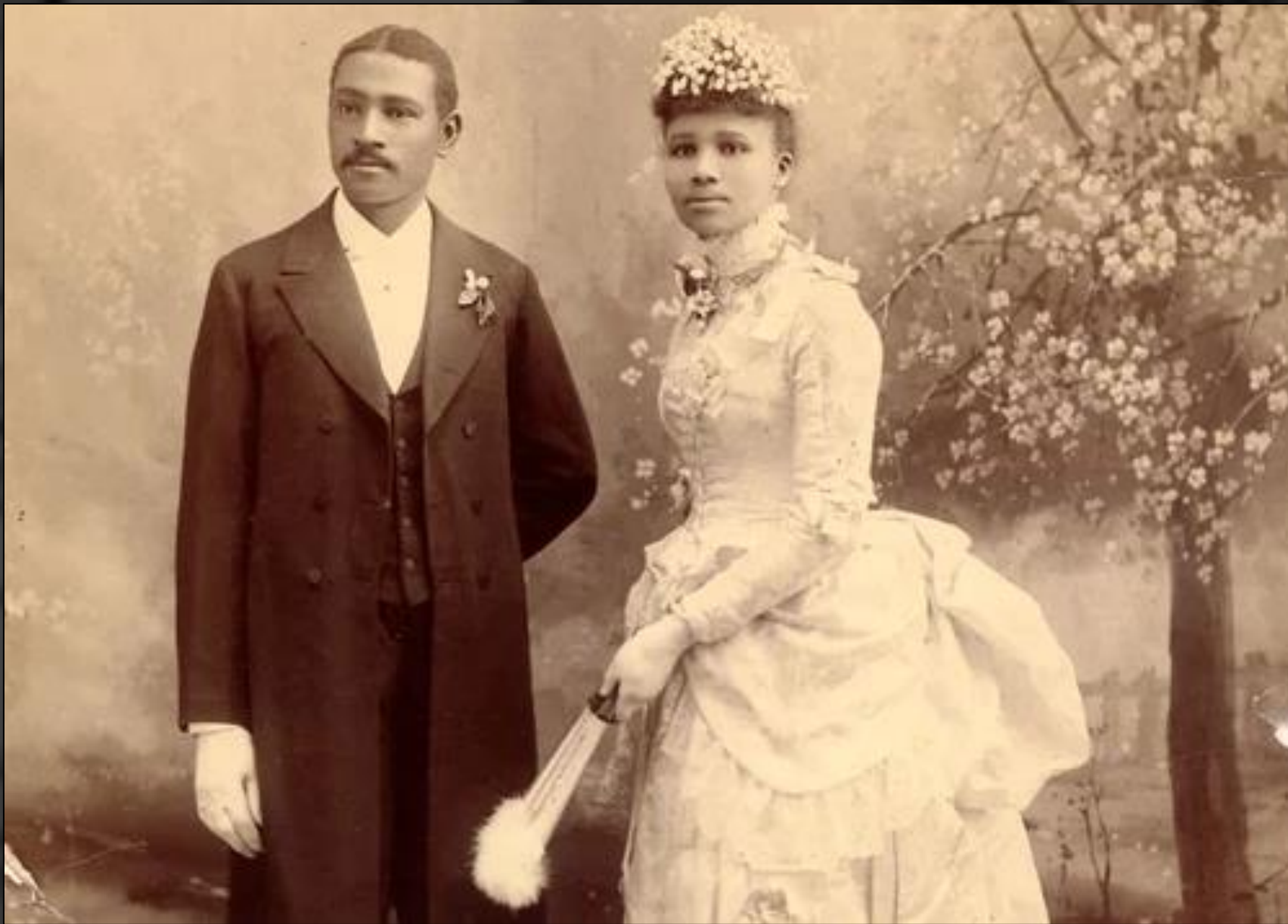
SOURCE: Bruce's Beach History Report, manhattanbeach-dot-gov / Images courtesy of the California African American Museum